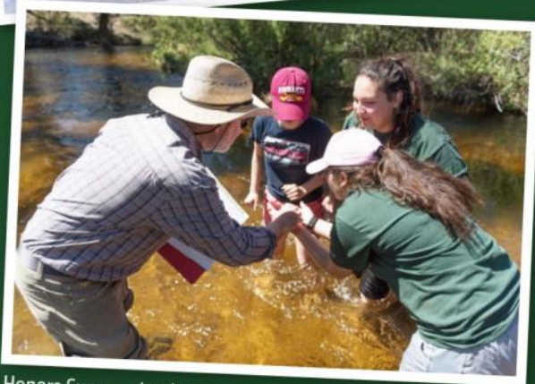
Honors Summer Institute