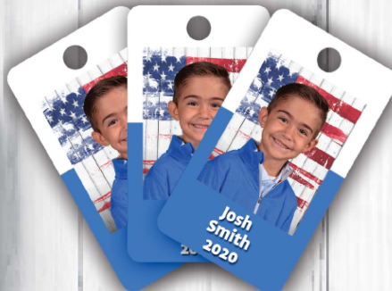
3 KEY FOBS