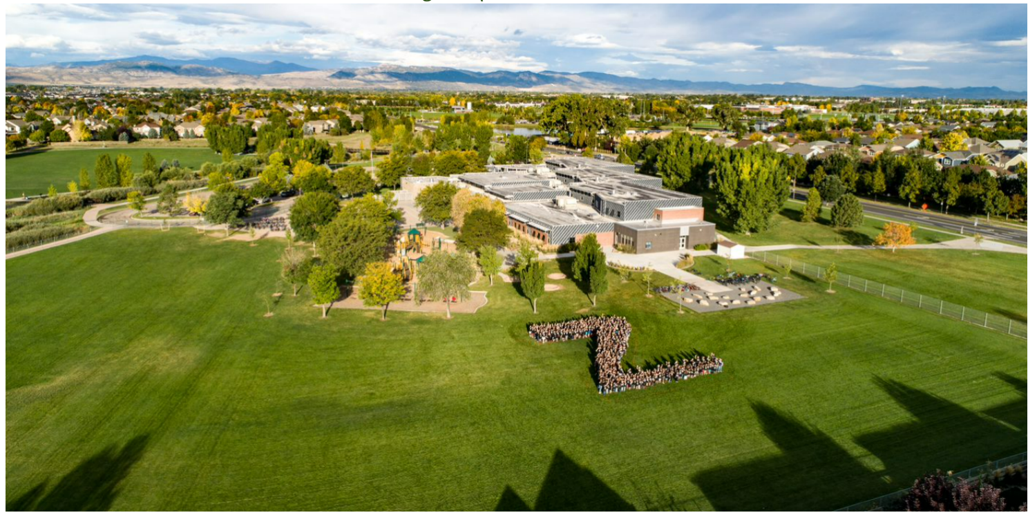
Picture taken Friday, September 30th with our 'Sko Ridge shirts. We love our Zach school family!

Mission: We commit to do our best to encourage, inspire and meet each child's needs.